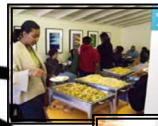
2nd Dramatic Table Read